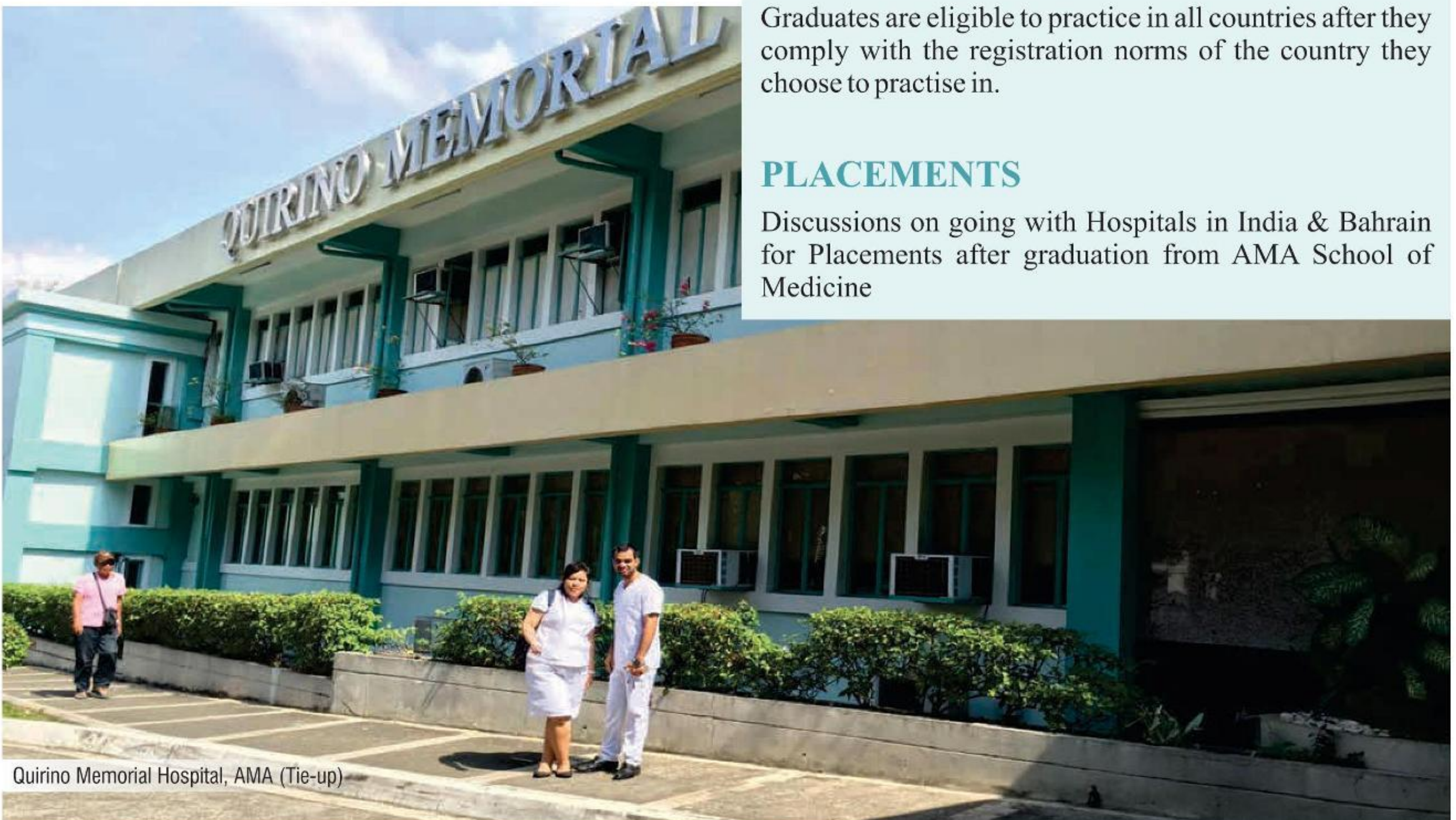
Quirino Memorial Hospital, AMA (Tie-up)

Discussions on going with Hospitals in India & Bahrain for Placements after graduation from AMA School of Medicine