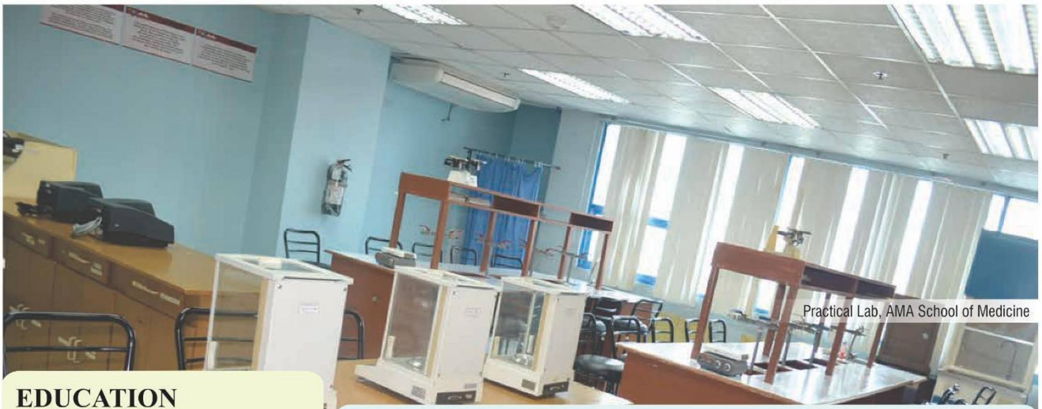
Practical Lab, AMA School of Medicine