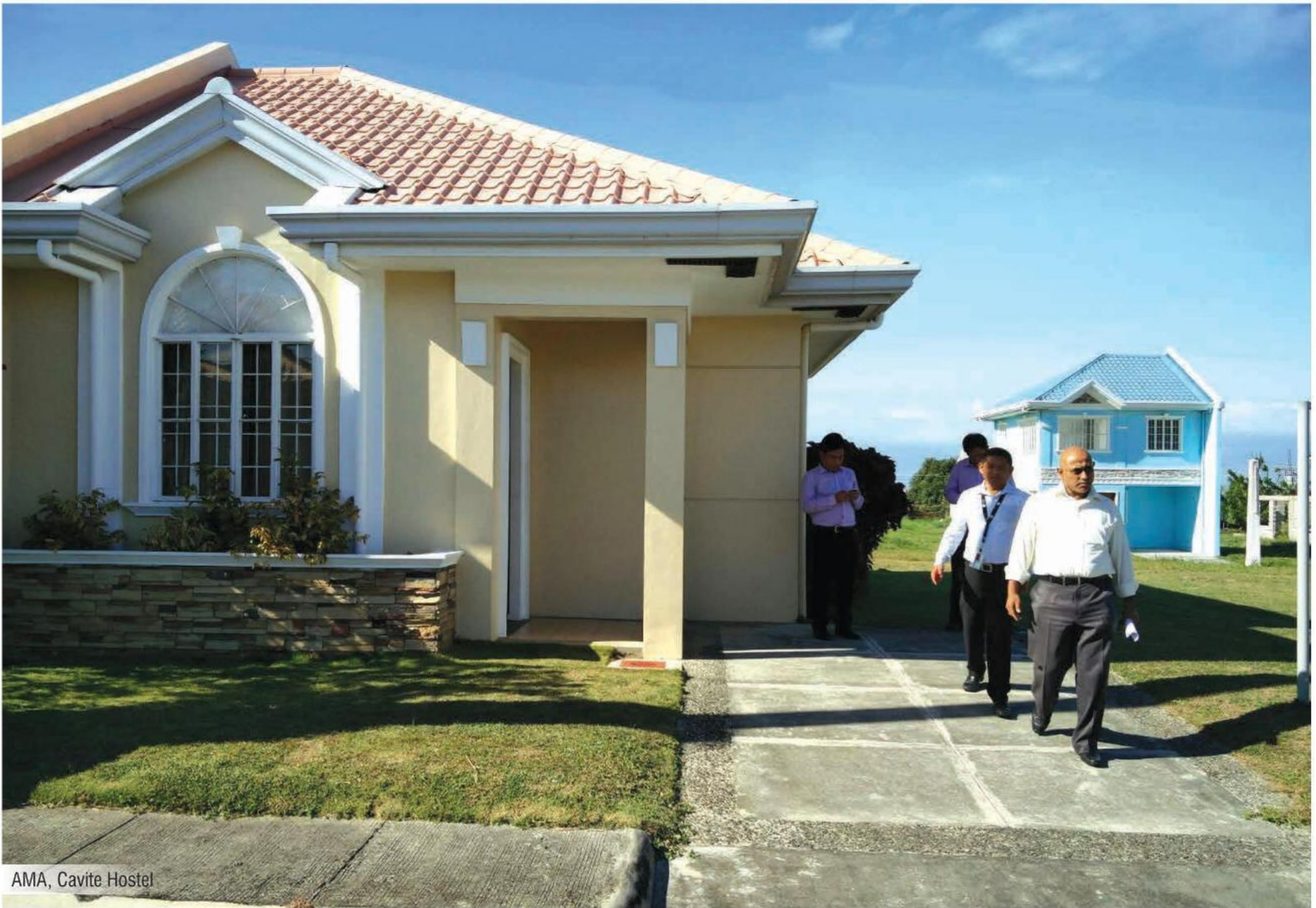
AMA, Cavite Hostel