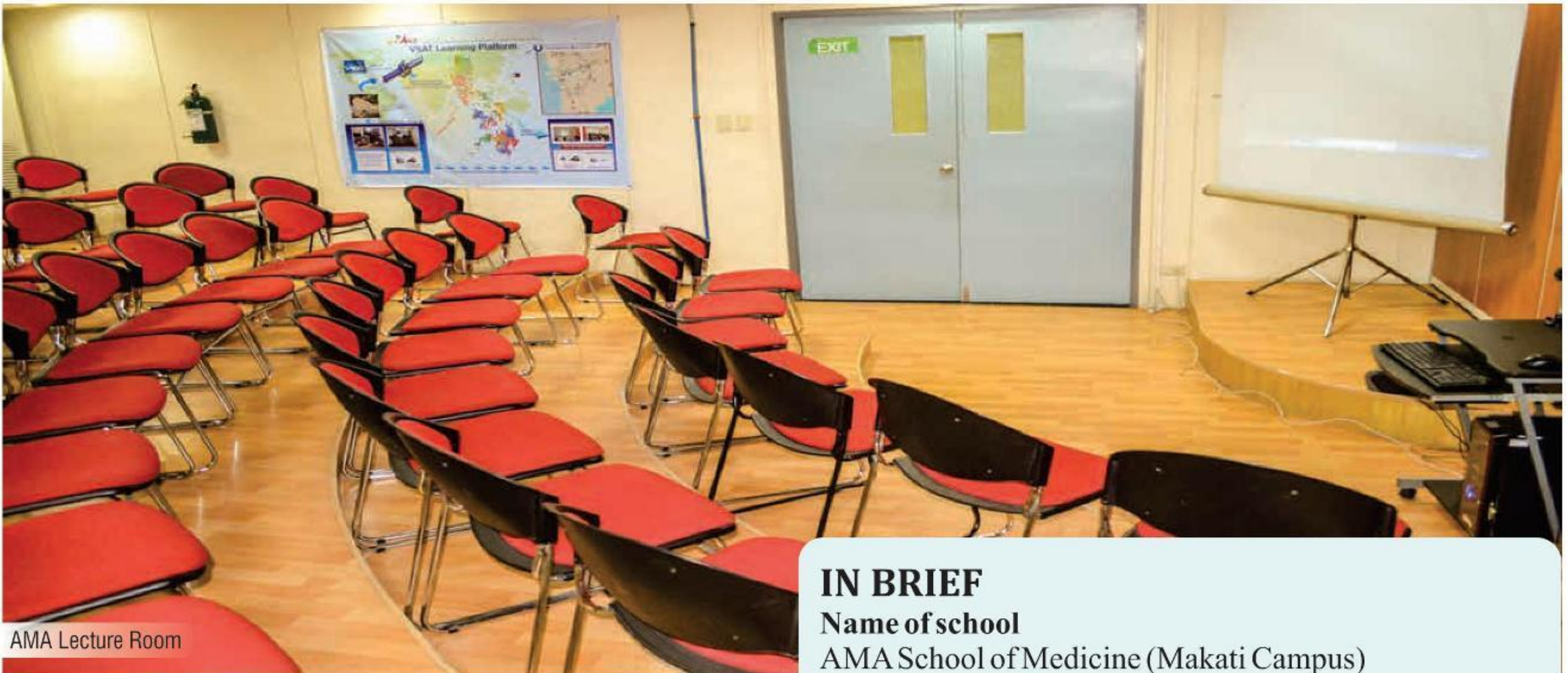
AMA Lecture Room