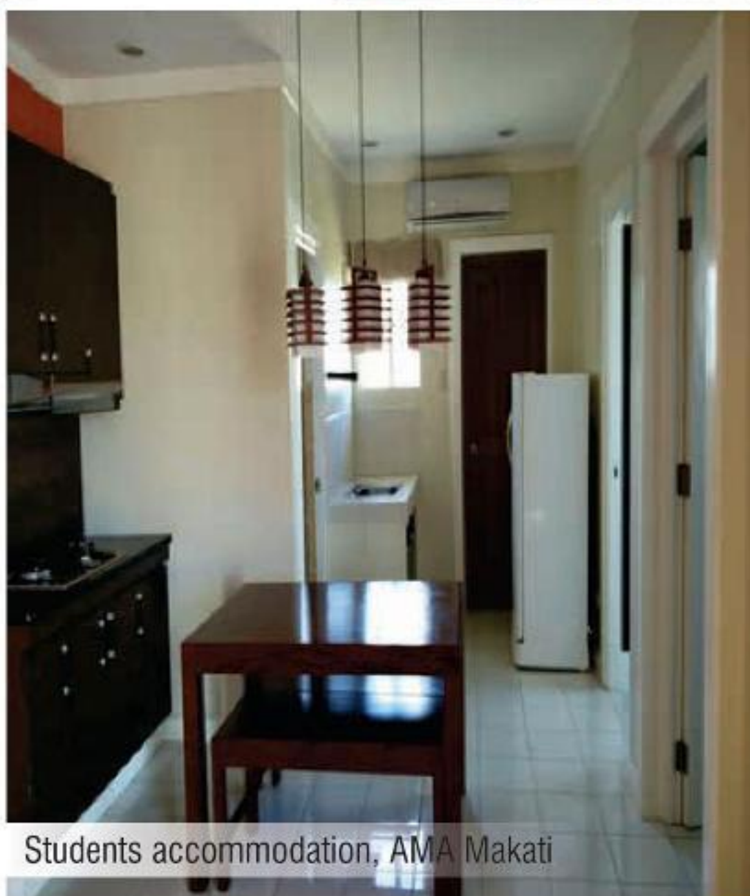
Students accommodation, AMA Makati