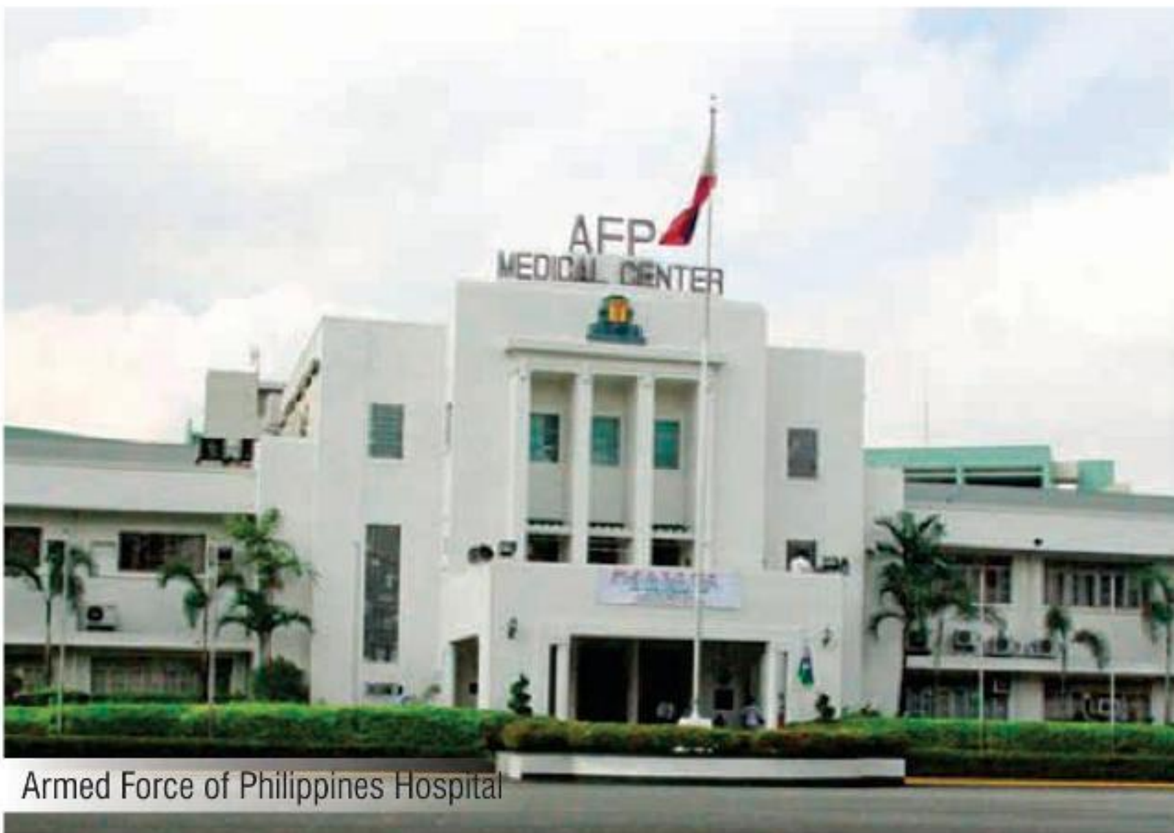
Armed Force of Philippines Hospital

AMA School of Medicine is listed in Medical Council of India.