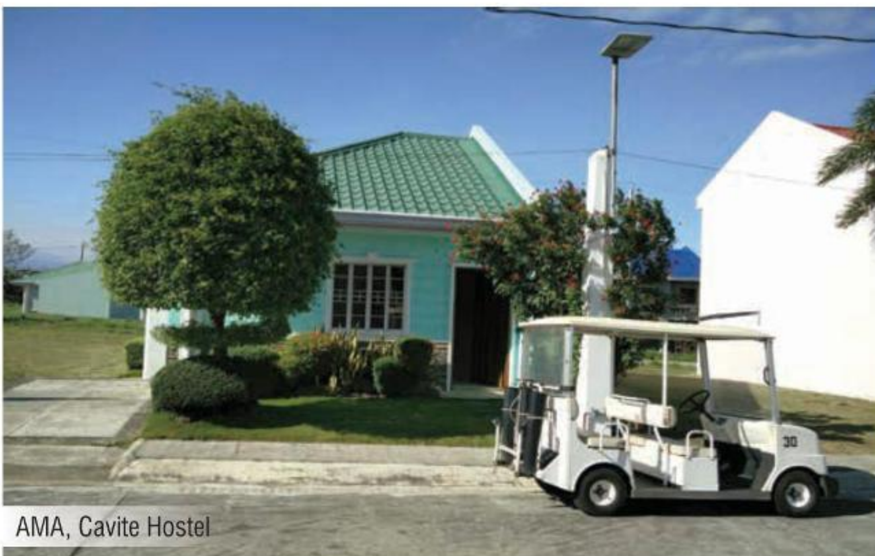
AMA, Cavite Hostel

There are plenty of eating places nearby. India food / catering arrangements are made for students from India. Laundry arrangements are there for students.