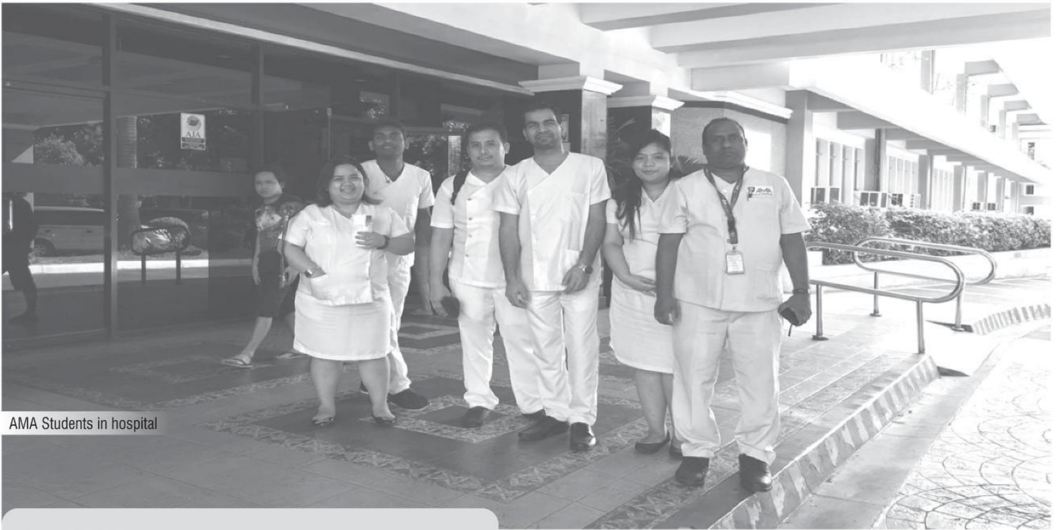
AMA Students in hospital